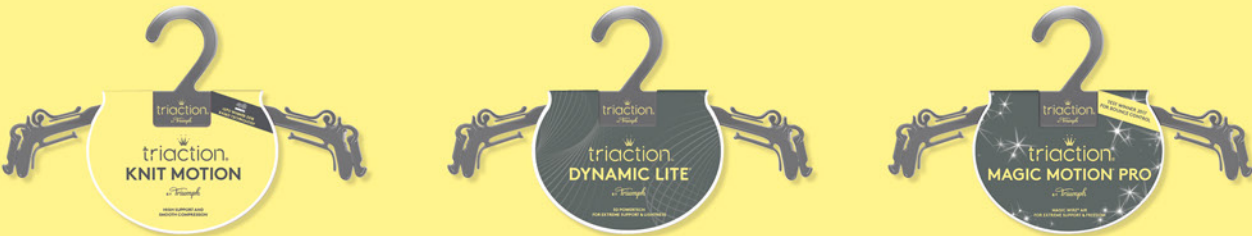
Magic Motion Pro Card Rider

2. A unique segmentation to answer all fits, sizes and sport activities .