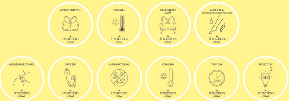
PRODUCT USP TAGS