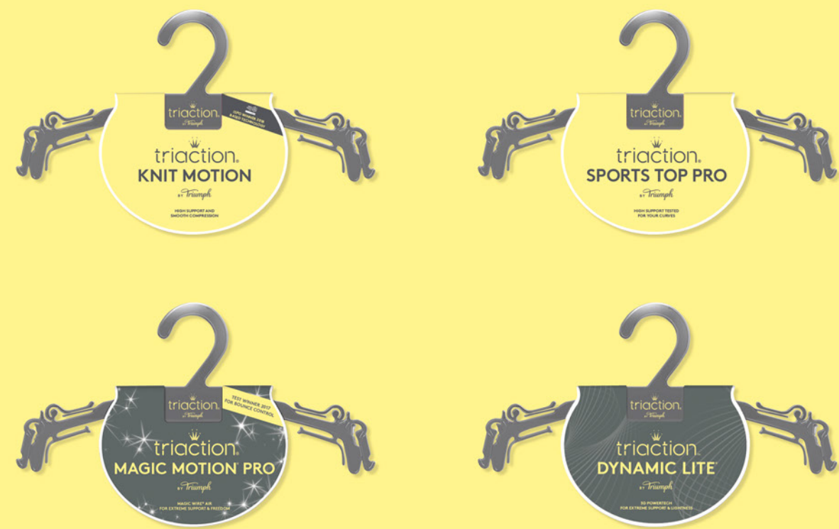
HANGER & CARD RIDER