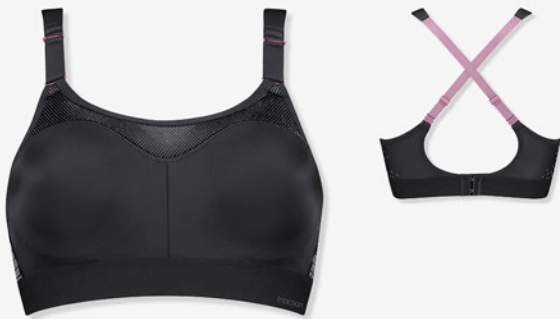
W01 · Black 0004

EU Cups B-F Size 70-100 EU Cup G Size 70-95 EU Cup H Size 70-90 UK Cups B-E Size 32-44 UK Cup F Size 32-42 UK Cup G Size 32-40 Material 81%PA, 19%EL SAP no. 10165861