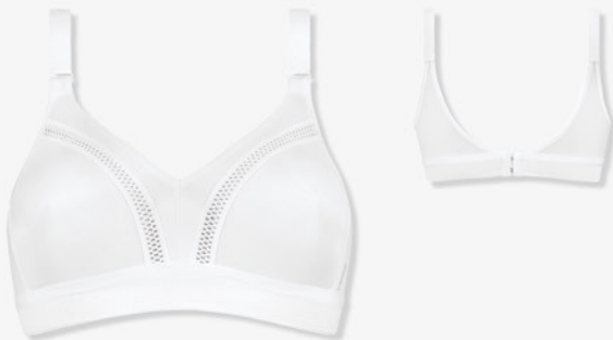
N - White 0003