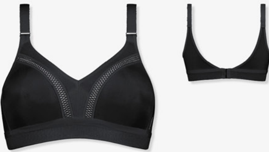
N - Black 0004