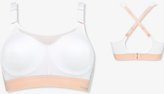
W01 · White 0003

EU Cups B-F Size 70-100 EU Cup G Size 70-95 EU Cup H Size 70-90 UK Cups B-E Size 32-44 UK Cup F Size 32-42 UK Cup G Size 32-40 Material 81%PA, 19%EL SAP no. 10165861