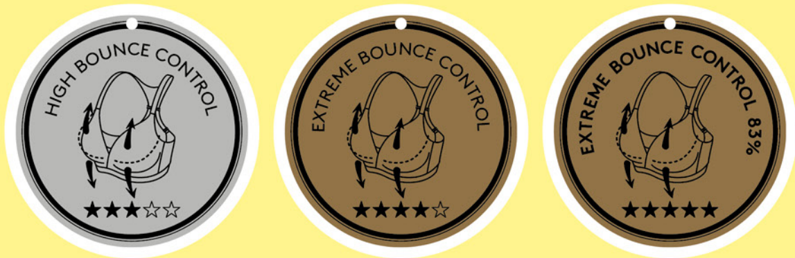
Knit Motion Card Rider

1. Best products with Certified Bounce Control and latest key innovation.